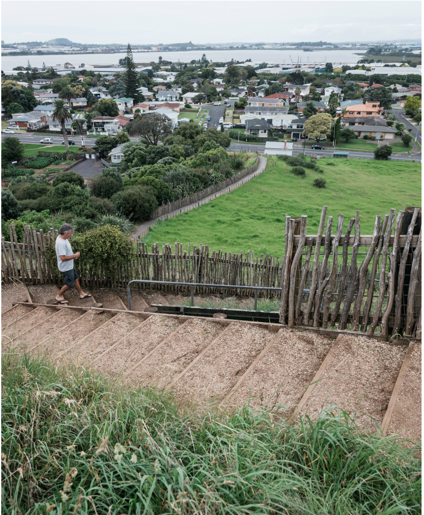
Image: Looking north east from Te Pane-o-Mataaho / Te Ara Pueru / Māngere Mountain