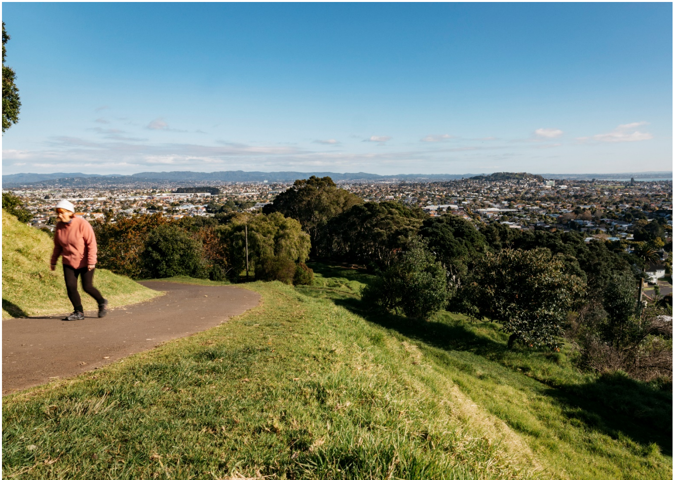
Image: Looking west on Te Tātua a Riukiuta / Big King