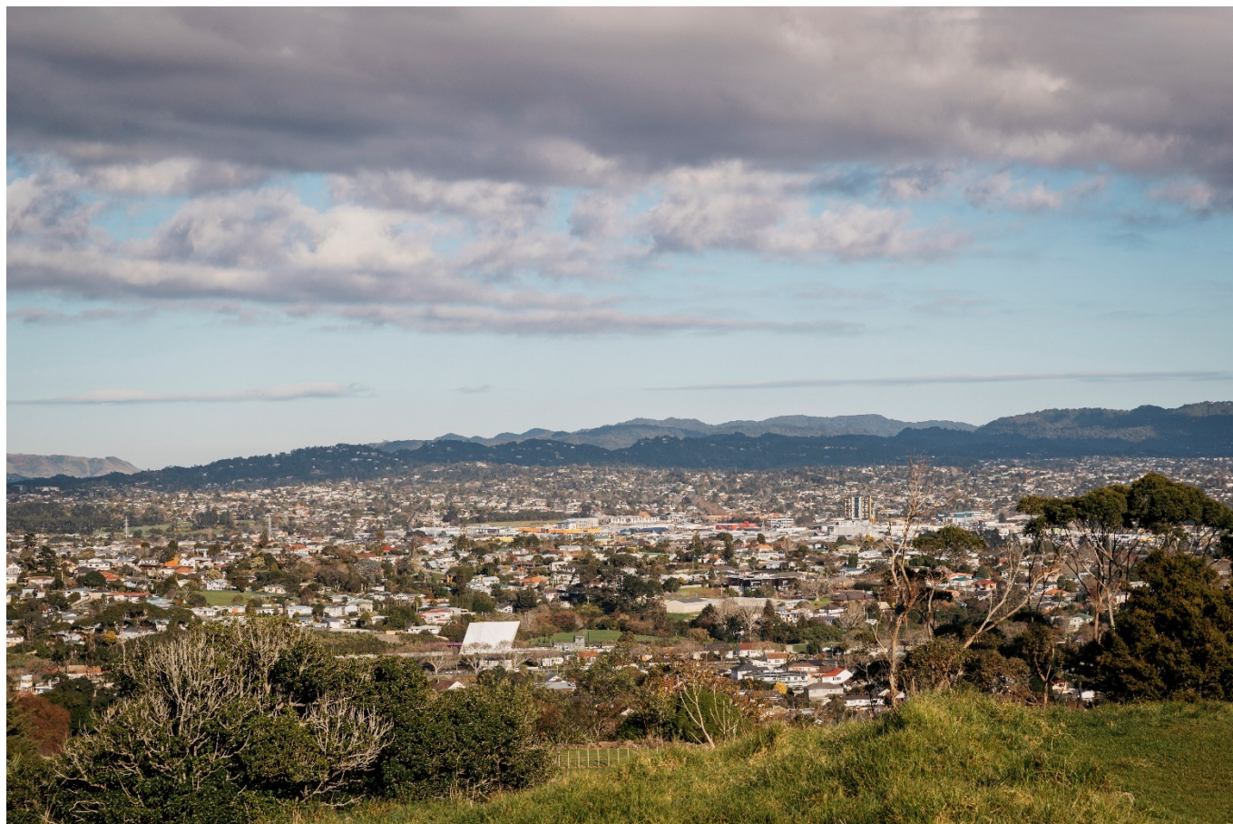
Image: View west from Ōwairaka / Te Ahi-kā-a-Rakataura / Mt Albert toward the Waitakere