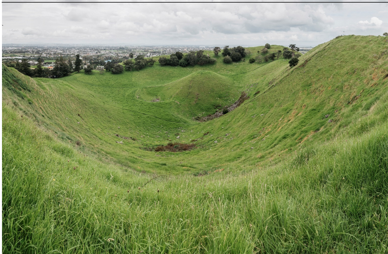
Image: Te Pane-o-Mataaho/Te Ara Pueru / Māngere Mountain