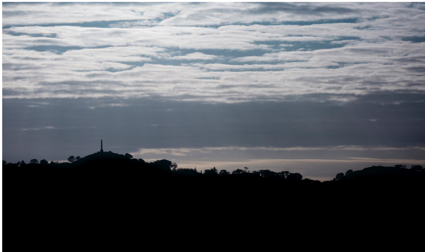
Image: View from Ōtāhuhu / Mt Richmond looking toward Maungakiekie / One Tree Hill